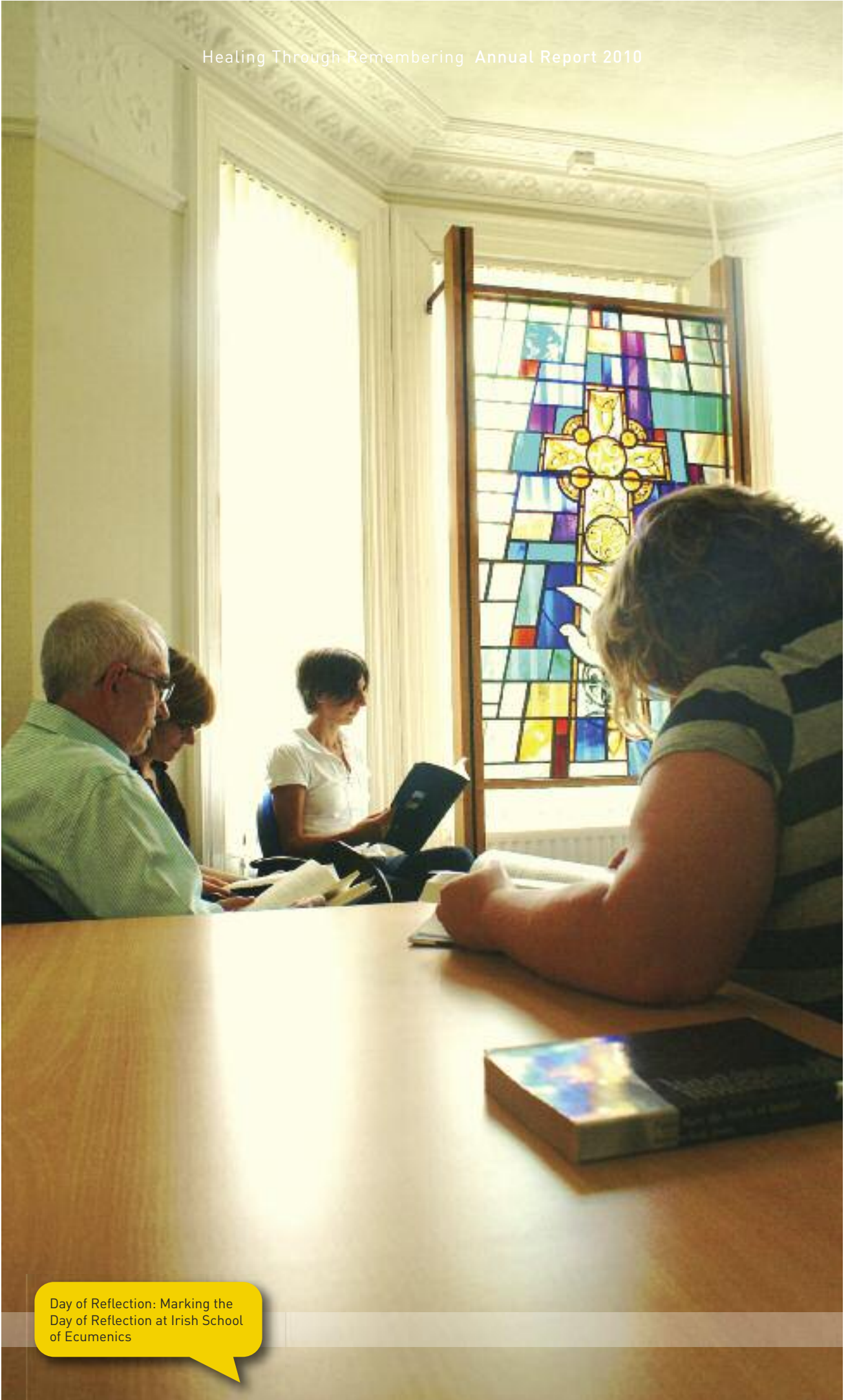
Day of Reflection: Marking the Day of Reflection at Irish School of Ecumenics